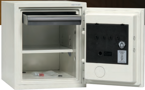
1222 - open

The Olympian's compact size makes it ideal for dorm rooms, dens and small businesses. Its spacious interior protects paper from fire for one hour, guards digital media (CDs, DVDs, USBs and memory sticks) for 30 minutes and includes a bolt-down kit.