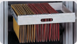
Pull-out File Hanger

Side Tab Filing Shelf available for 509 model