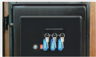
Inside Door Key Hanger