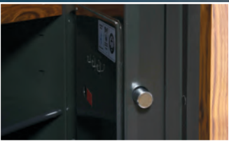
Large Bolt Work Protects Valuables