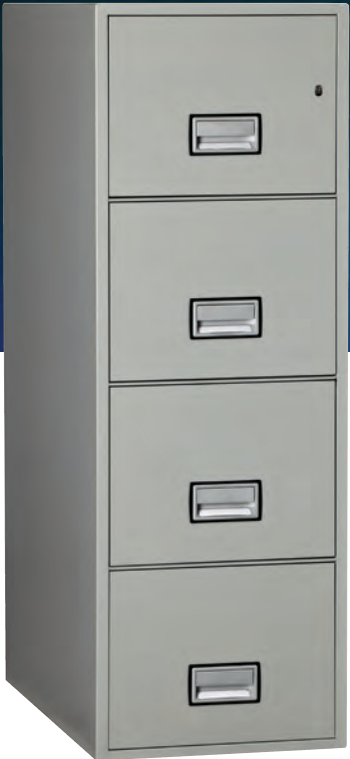
LGL4W25 Light Gray