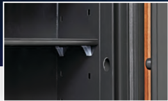
Height Adjustable Shelf (Additional Shelves Available)

FIRE, EXPLOSION, & MTC GRADE B PROTECTION