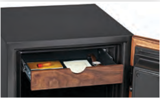
Small Walnut Slide Drawer (Additional Drawers Available)

Rugged metal fire doors and sturdy drawers combined with wood finishes. Our Fire Safes are truly the perfect combination of both beauty and world class protection. A perfect accent to any home office decor, these luxury fire safes are specifically engineered to provide the peace of mind that valuable documents and other items remain secure.