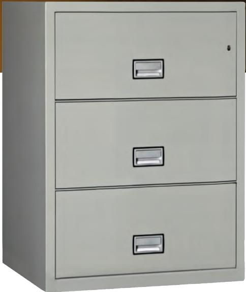
LAT3W31 Light Gray

With World Class vertical files, you'll experience elite on-site records protection, elegant design and guaranteed durability.